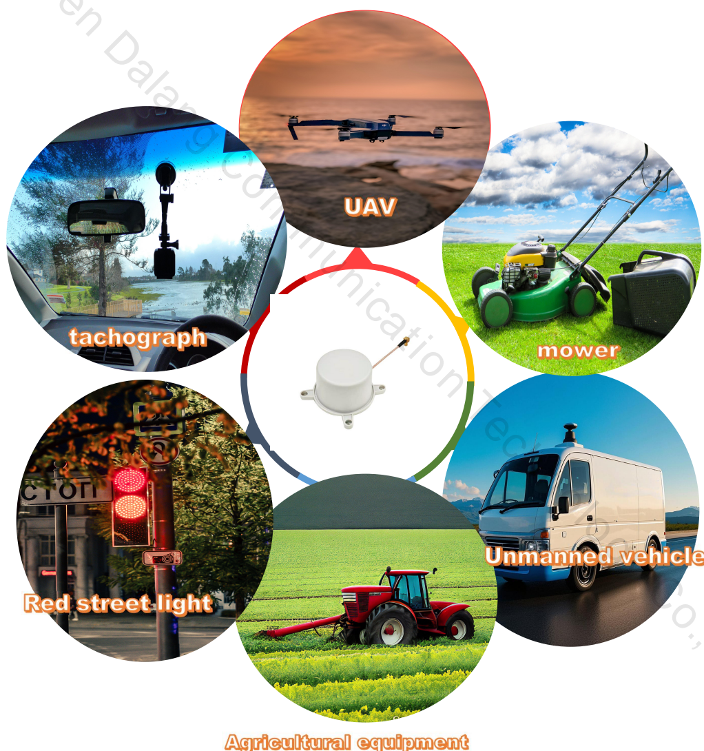
Figure 1 Product Application Scenarios

The AK701-GNSS antenna is a high-performance device with advanced eight-arm coupling and four-feed point technology. It supports Beidou, GPS, GLONASS, and GALILEO systems, receiving L1, L2, and L5 signals. With a built-in low-noise amplifier (LNA) and dualstage filter system, it enhances signal quality and clarity, excelling in anti-interference. Ideal for high-precision and multi-system applications like geodetic surveying, precision agriculture, and vehicle navigation. See Figure 1 for details.