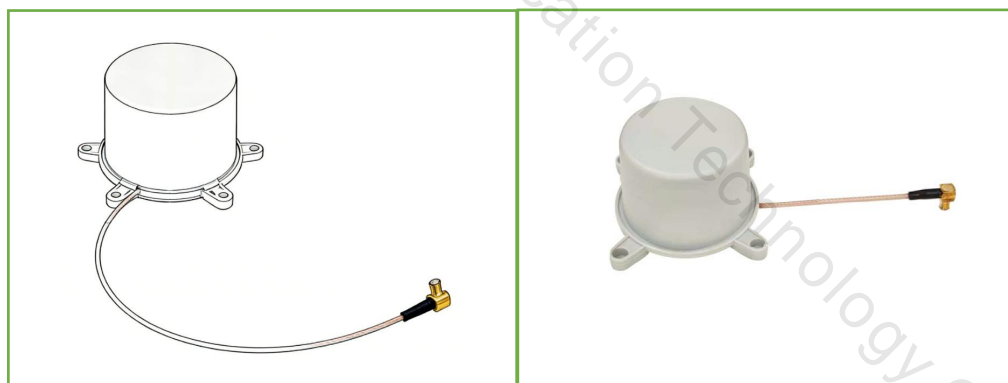
Figure 3 Product correlation chart