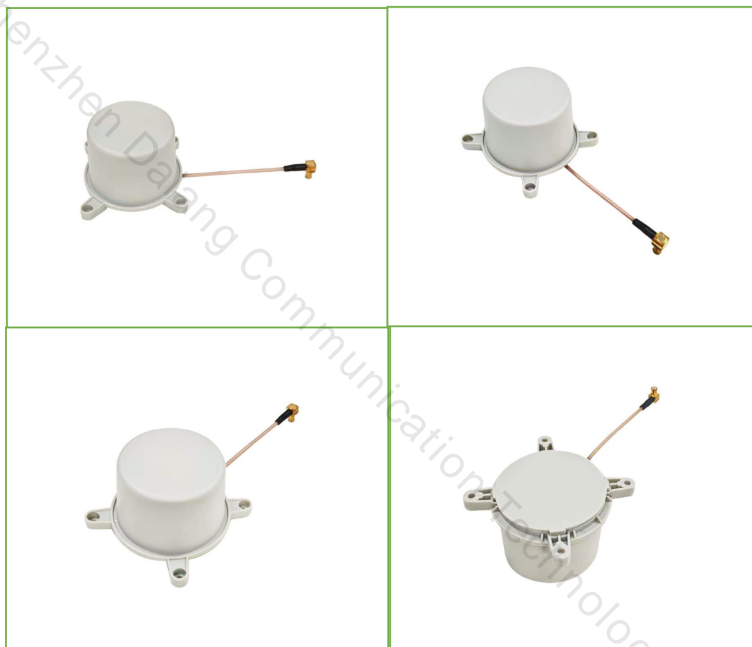
Figure 5 Product Images

In this chapter, we will showcase real-life images of the product, as shown in Figure 5. These images provide a detailed view of our product from various angles and perspectives. We believe that through authentic representation, we can better convey the value and concept of the product, thereby enhancing your trust and satisfaction.