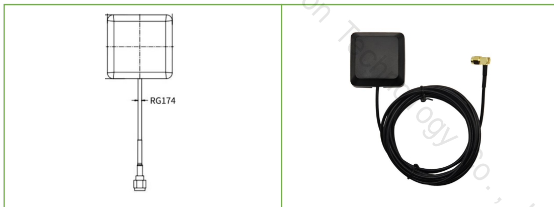
Figure 3 Product correlation chart