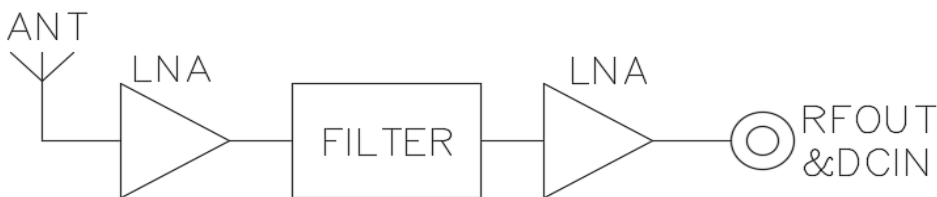
Figure 4 Process flow diagram