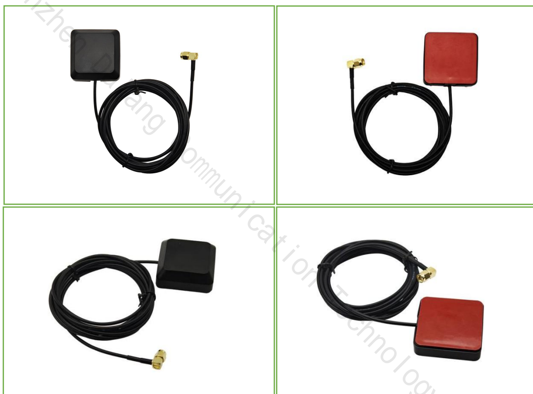
Figure 5 Product Images

In this chapter, we will showcase real-life images of the product, as shown in Figure 5. These images provide a detailed view of our product from various angles and perspectives. We believe that through authentic representation, we can better convey the value and concept of the product, thereby enhancing your trust and satisfaction.