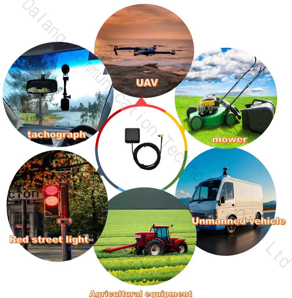
Figure 1 Product Application Scenarios

Our company's AK211 single-layer ceramic (40 * 40 * 4) active antenna is equipped with a built-in low-noise amplifier, which can significantly improve signal gain, enhance reception sensitivity, and easily capture weak signals. At the same time, it can effectively compensate for losses during signal transmission, reduce signal attenuation, and operate stably in complex electromagnetic environments. This antenna is compact in size and easy to integrate into various devices that require strict space, helping devices achieve miniaturization and lightweight. And it has good frequency selectivity, can filter out interference signals, multi band support function can also meet the needs of different communication standards, and has a wide range of application scenarios. Refer to Figure 1 for details.