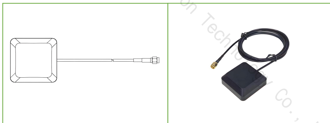
Figure 3 Product correlation chart