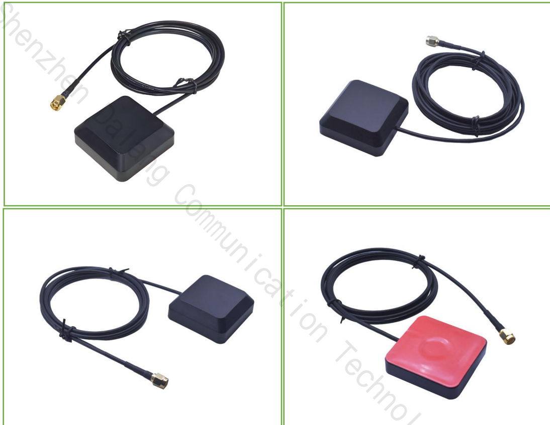
Figure 5 Product Images

In this chapter, we will showcase real-life images of the product, as shown in Figure 5. These images provide a detailed view of our product from various angles and perspectives. We believe that through authentic representation, we can better convey the value and concept of the product, thereby enhancing your trust and satisfaction.