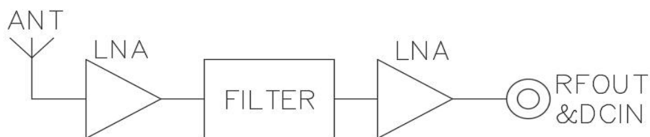
Figure 4 Process flow diagram