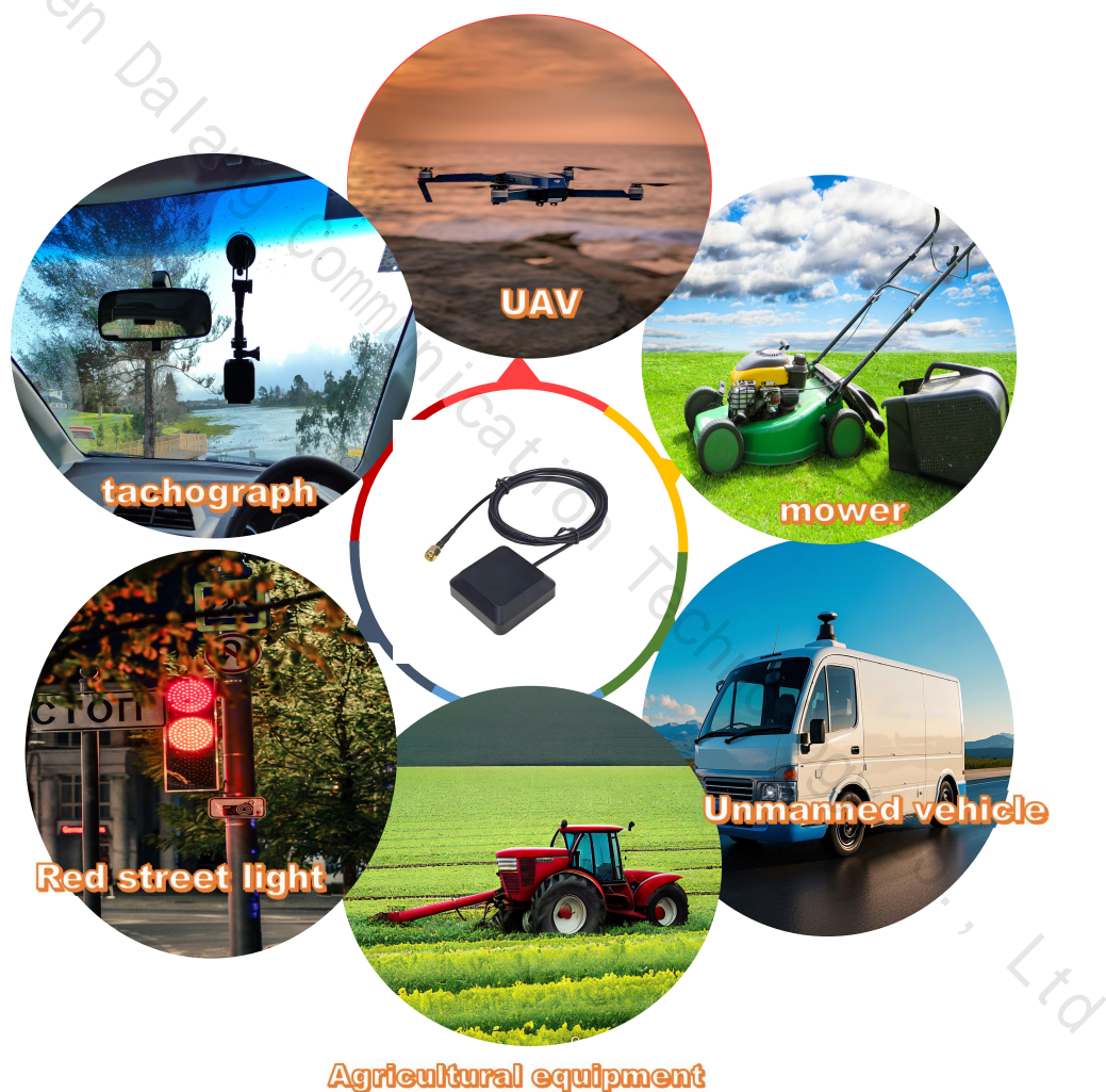
Figure 1 Product Application Scenarios

Our company's AK203 high-performance external antenna adopts advanced stacked ceramic antenna design, integrating L1+L5 dual band receiving capability, specially designed for high-precision positioning and navigation applications. By incorporating a multi-layer ceramic structure, the antenna achieves excellent multi band signal capture performance in a compact size. Combined with the gain advantage of an external antenna, it significantly improves signal reception strength and stability, making it suitable for high demand scenarios such as drones, surveying equipment, in car navigation, and intelligent transportation. Refer to Figure 1 for details.