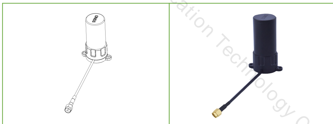
Figure 3 Product correlation chart