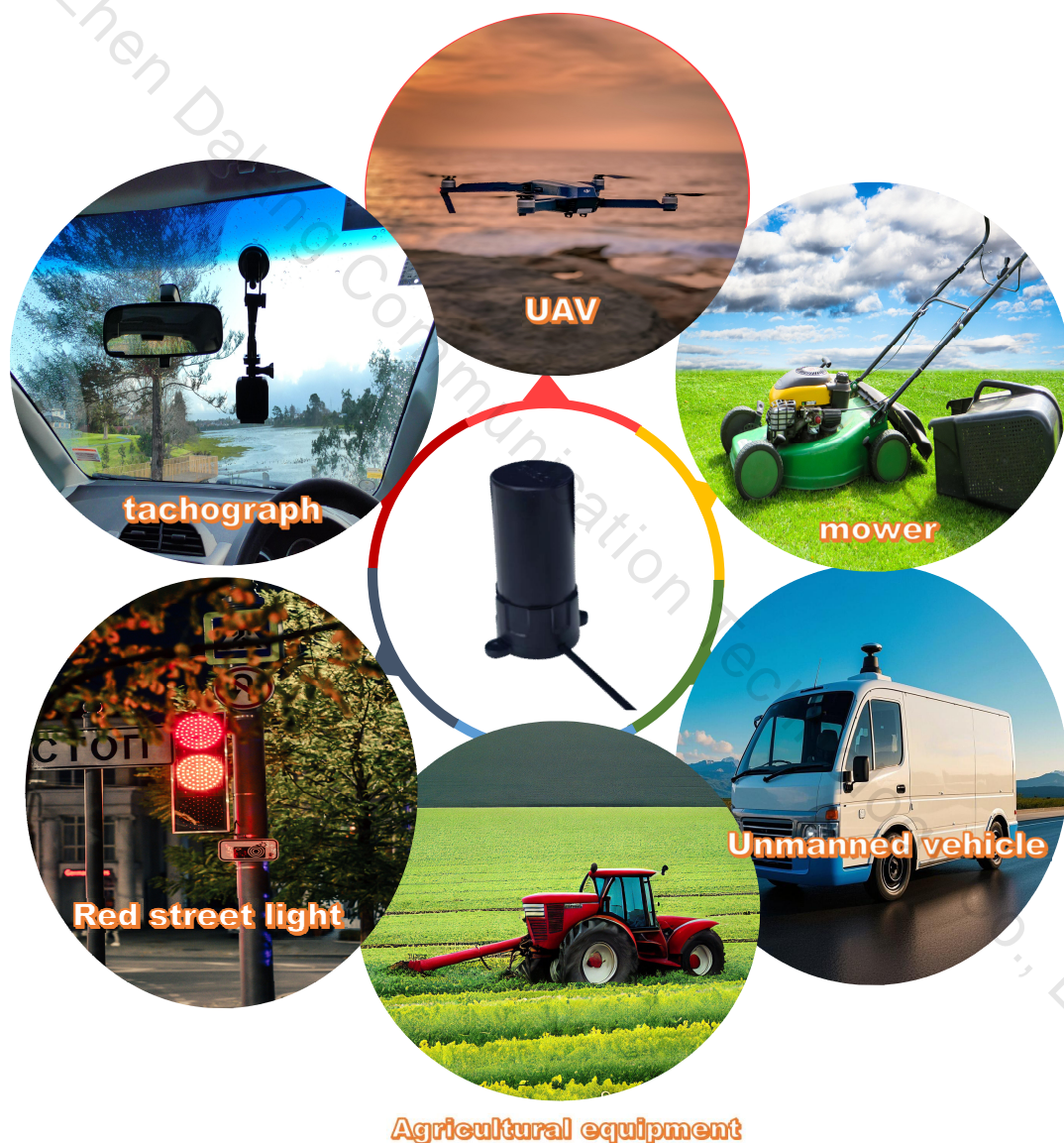
Figure 1 Product Application Scenarios

The AK161-GNSS antenna features advanced quad-arm coupling and four-feed point technology, supporting Bei Dou, GPS, GLONASS, and GALILEO across L1, L2, and L5 bands. Equipped with a Low Noise Amplifier (LNA), it enhances signal quality, making it ideal for high-precision and multi-system GNSS applications in geomatics, precision agriculture, and vehicle navigation. See Figure 1 for details.