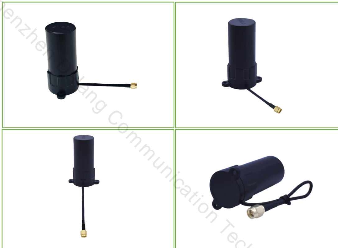
Figure 5 Product Images

In this chapter, we will showcase real-life images of the product, as shown in Figure 5. These images provide a detailed view of our product from various angles and perspectives. We believe that through authentic representation, we can better convey the value and concept of the product, thereby enhancing your trust and satisfaction.