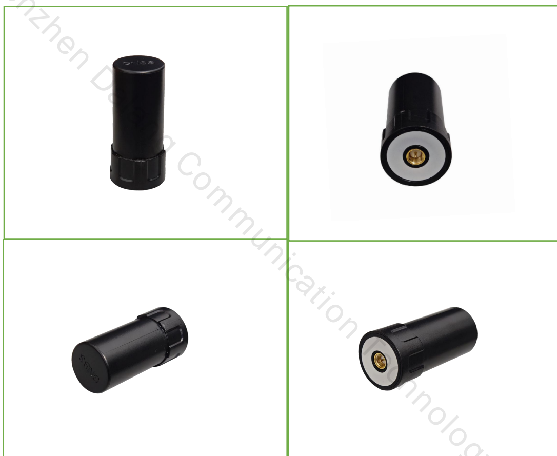
Figure 5 Product Images

In this chapter, we will showcase real-life images of the product, as shown in Figure 5. These images provide a detailed view of our product from various angles and perspectives. We believe that through authentic representation, we can better convey the value and concept of the product, thereby enhancing your trust and satisfaction.