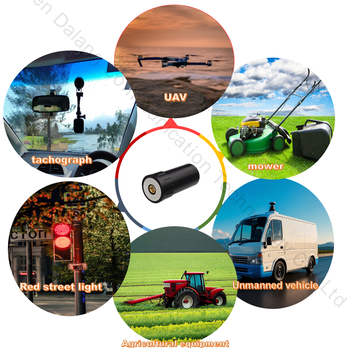
Figure 1 Product Application Scenarios

The AK159 GNSS antenna is a high-performance device with advanced eight-arm coupling and four-feed point technology. It supports Beidou, GPS, GLONASS, and GALILEO systems, receiving L1, L2, and L5 signals. With a built-in low-noise amplifier (LNA) and dualstage filter system, it enhances signal quality and clarity, excelling in anti-interference. Ideal for high-precision and multi-system applications like geodetic surveying, precision agriculture, and vehicle navigation. See Figure 1 for details.