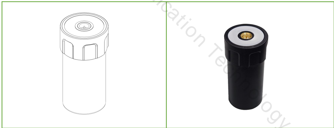
Figure 3 Product correlation chart