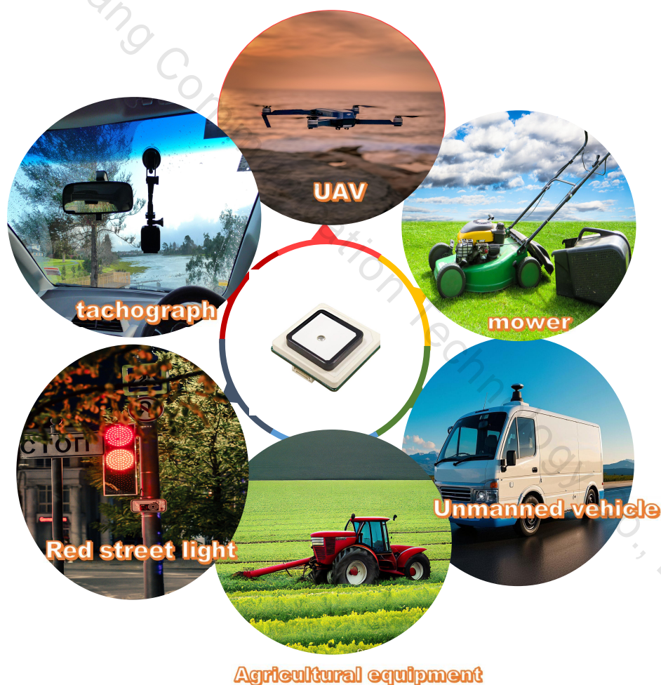
Figure 1 Product Application Scenarios

The AK721-JM GNSS module supports multiple star systems (GPS/GLONASS/Galileo/BDS/QZSS) and L1/L5 dual frequency technology, ensuring stable positioning in complex environments. With a super high sensitivity of -166dBm, it can accurately capture satellite signals even in weak signal areas. The fastest cold start time is only 5 seconds (AGNSS on), and the hot start response time is 1 second, meeting high efficiency requirements. More support centimeter level RTK positioning (horizontal 1cm+1ppm), providing reliable support for high-precision applications such as drones, precision agriculture, and surveying. The strong adaptability at an altitude of 10000 meters and a speed of 500m/s makes it easy to cope with challenges in vehicle, aviation, and industrial levels. Refer to Figure 1 for details.