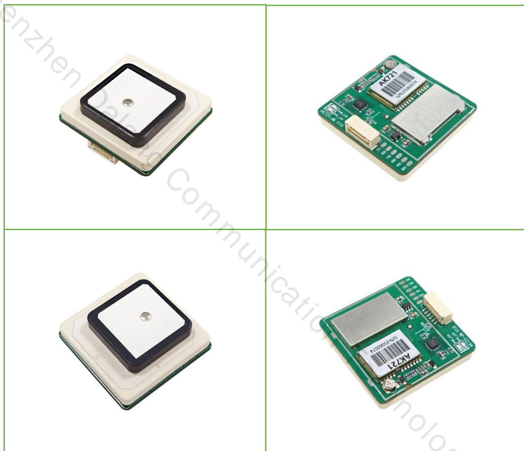
Figure 4 Product Images

In this chapter, we will showcase real-life images of the product, as shown in Figure 4. These images provide a detailed view of our product from various angles and perspectives. We believe that through authentic representation, we can better convey the value and concept of the product, thereby enhancing your trust and satisfaction.