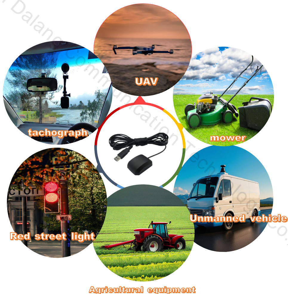
Figure 1 Product Application Scenarios

The DL28U9U module integrates advanced UBX-M9140 modules and is equipped with high-performance ceramic antennas that can simultaneously track satellite signals from up to four GNSS constellations, ensuring precise positioning even in challenging environments such as complex urban canyons. This receiver performs excellently in distinguishing positioning signals from environmental noise, and can effectively capture positioning data even under weak satellite signal conditions. This module can be used for automotive and industrial tracking applications, such as navigation, remote information processing, and drones. Refer to Figure 1 for details.