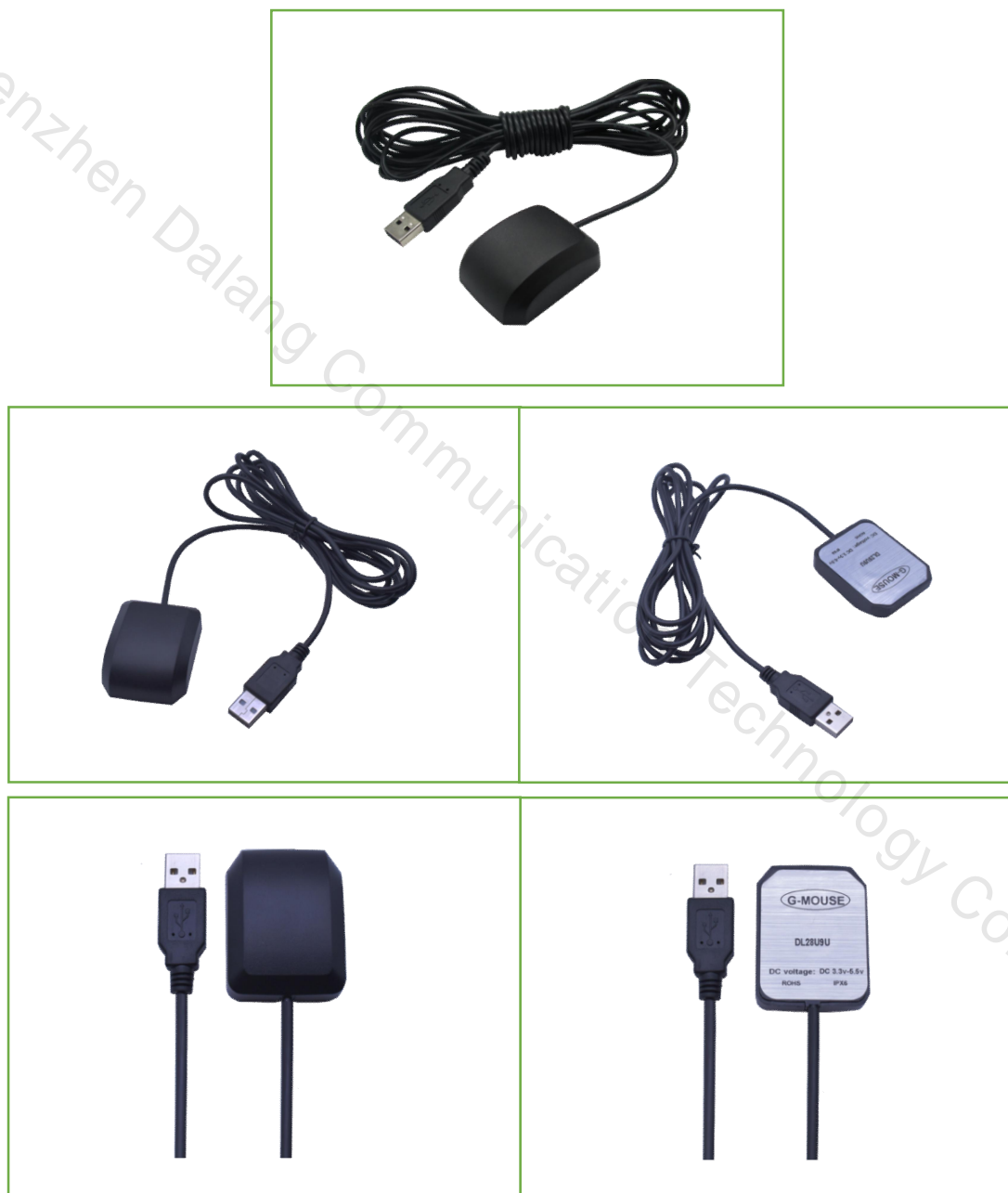
Figure 3:Physical display image

In this chapter, we will present real-life photos of the product, as shown in Figure 3. Through these pictures, you can see our products from different angles and details. We believe that through authentic display, we can better convey the value and philosophy of the product, thereby enhancing your trust and satisfaction with the product.