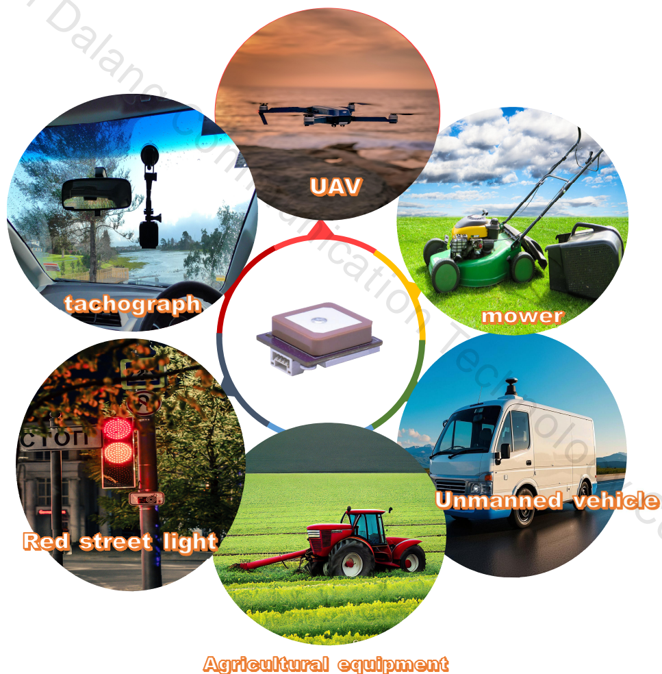
Figure 1 Product Application Scenarios

The DL20U9A module integrates advanced u-bloxUBX-M9140 modules and is equipped with high-performance ceramic antennas that can simultaneously track satellite signals from up to four GNSS constellations, ensuring precise positioning even in challenging environments such as complex urban canyons. This receiver performs excellently in distinguishing positioning signals from environmental noise, and can effectively capture positioning data even under weak satellite signal conditions. This module can be used for automotive and industrial tracking applications, such as navigation, remote information processing, and drones. Refer to Figure 1 for details.