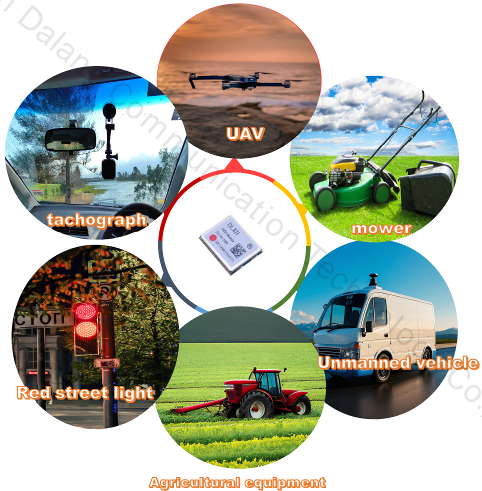
Figure 1 Product Application Scenarios

The DL1612M9 module uses the advanced u-blox M9 GNSS chip, providing excellent sensitivity, fast signal acquisition, and support for all L1 GNSS systems. It offers meter-level accuracy and can simultaneously receive signals from four GNSS systems, enhancing positioning accuracy in complex environments like urban canyons. The module features interference and spoofing detection, advanced filtering to mitigate RF interference, and integrates LNA and SAW filters for stable operation even in strong RF interference environments. See Figure 1 for details.