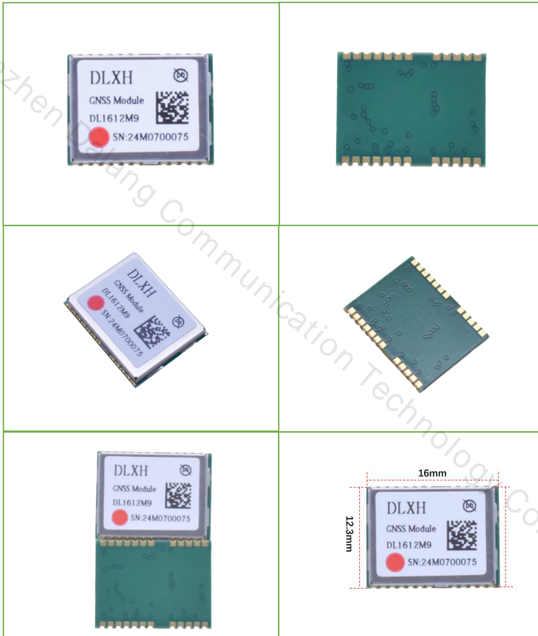
Figure 4 Product Images

In this chapter, we will showcase real-life images of the product, as shown in Figure 4. These images provide a detailed view of our product from various angles and perspectives. We believe that through authentic representation, we can better convey the value and concept of the product, thereby enhancing your trust and satisfaction.